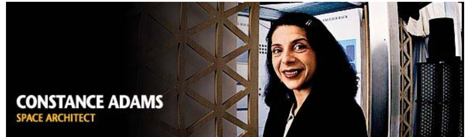
CONSTANCE ADAMS SPACE ARCHITECT

Space exploration is the physical exploration of outer space beyond earth. Space exploration propels scientific research and is focused on the future survival of humanity.